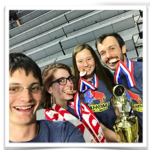
Honors Odyssey of the Mind team won third place at the World Finals hosted at Michigan State