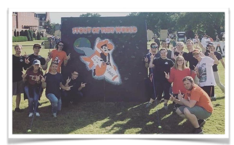
The Honors LLP showed once again that they are "Stout of this World" with their 3rd consecutive homecoming victory